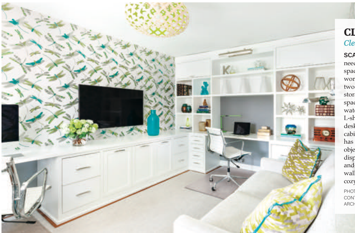
CONTRIBUTOR: ANTHONY LODDO, GENERAL CONTRACTING

CHAPPAQUA This home office was elevated by layering moody, monochromatic gray tones. Striving for both form and function, custom cabinetry has the same dark tones; it hides files, a printer, and supplies. All of the chairs swivel, so guests can adjust their viewpoint and there is a laptop perch under the light-filled window.